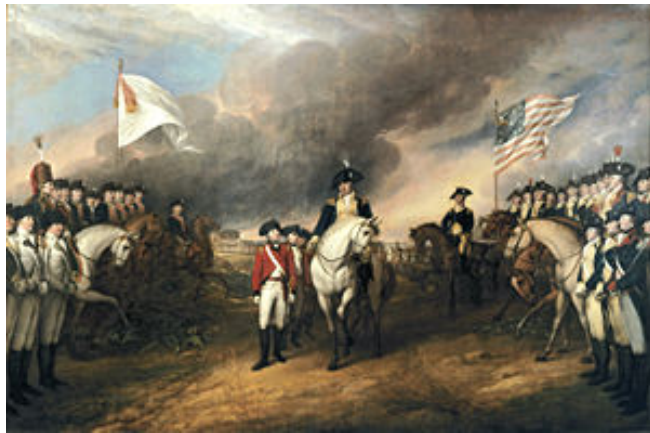
Surrender of Cornwallis at Yorktown by John Trumbull (1756-1843)

Key Understanding: The world turned upside down at Yorktown. According to legend, the British band played the song The World Turned Upside Down as they were surrendering to the Americans and French at Yorktown, Virginia, on October 19, 1781. The Battle of Yorktown victory for the Declaration of Independence of 1776 was in fulfillment of a “Body of Americans,” or “Body of George Washington,” counterfeit of Acts 17:6-7, a passage which represents true believers in the Body of Christ. The “Body of Americans” Turned the World Upside Down on October 19, 1781, and in the eyes of the Laodicean Church, which is deceived and confused on the