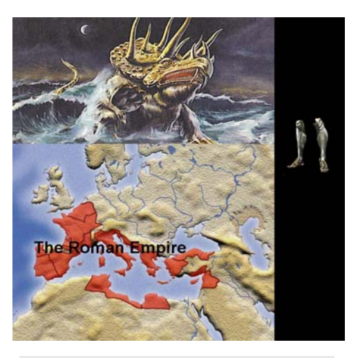
The kingdom shall be divided. The division of the Empire after the death of Theodosius I, ca. 395 A.D., superimposed on modern borders.

42 And as the toes of the feet were part of iron, and part of clay, so the kingdom shall be partly strong, and partly broken.