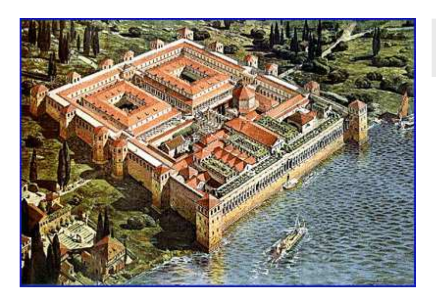
(left), Diocletian's Palace at Split (below), Iron Gate and Clock Tower at Diocletian's Palace

Diocletian's Palace. Diocletian's Palace at Split was constructed between 293-305 A.D., and today is the best preserved palace of its antiquity in the world.