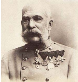
Franz Joseph I (above) was the emperor of the Austrian Empire from 1848-1916