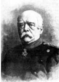
German chancellor Otto von Bismarck (above) was the architect of the Dual Alliance

Key Understanding: The Dual Alliance between Germany and Austria. The nations of Germany and Austria had a historically recognized duality – akin to twins – as concerned the historical development of the Holy Roman Empire, which met its end in the year 1806. This duality of Austria and Germany culminated on October 7, 1879, as they signed an alliance that carried them together militarily into World War I.