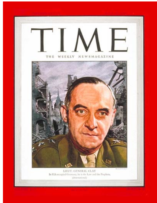
General Lucius Clay on the June 25, 1945, cover of Time

Key Understanding: Clay governed Broken Clay Germany. The Lord ordained that a man named Clay govern the American occupation zone of Broken Clay Germany in 1947-1949, the years directly before the nation of West Germany was formed. This was a part of the fulfillment of Daniel 2:42.