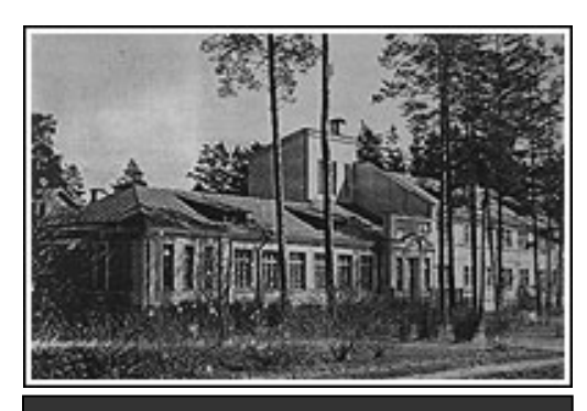
Residence of the German rocket team in the village of Mamontovka near Moscow circa 1947

Key Understanding: The mixture of Germany, the U.S., and the USSR in the space race. The same three nations of Germany, the United States, and the Soviet Union that are seen in the prophetic outworking of Daniel 2:41-43, because of the combination of World War II and the Cold War, are also seen in Revelation 17:10-11, through the Space Race. The point is that the Lord emphasized the role