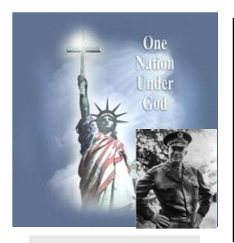
U.S. - strong iron