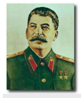
USSR – strong iron