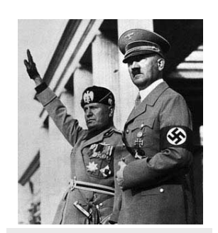
Germany – strong iron

Daniel 2:43 (KJV) And whereas thou sawest IRON <u>MIXED</u> with miry CLAY, they shall mingle themselves with the seed of men: but <u>THEY</u> [U.S. vs. USSR in the Space Race, represented by the October 4, 1957, launch of Sputnik] <u>SHALL NOT CLEAVE ONE TO ANOTHER</u>, even as IRON is <u>NOT MIXED</u> with CLAY.