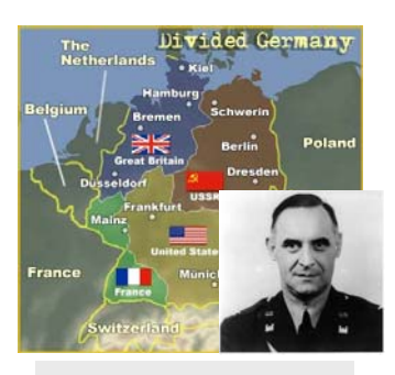
Germany – broken clay

Germany was a 'Pact of Steel' Strong Iron Foot when it invaded and occupied a Broken Clay France in June 1941. But then on May 7, 1945, at 2:41 a.m., Germany surrendered and became a Broken Clay Foot when crushed by the Allied Strong Iron Foot of the U.S./USSR.