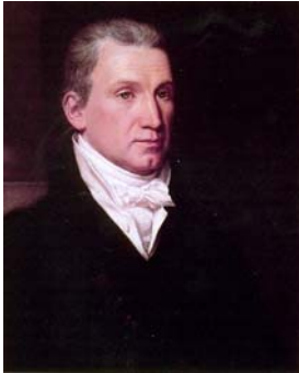
President James Monroe

The Monroe Doctrine. The Monroe Doctrine was set forth by President James Monroe in a message he delivered to the Congress of the United States on December 2, 1823. It warned European powers against interfering in the affairs of countries in the Western Hemisphere, and specifically warned them not to involve themselves with the peoples of the Western Hemisphere “for the purpose of oppressing them, or controlling in any other manner their destiny.” The Monroe Doctrine said also that the American continents were “henceforth not to be considered as subjects for future colonization by any European powers.”