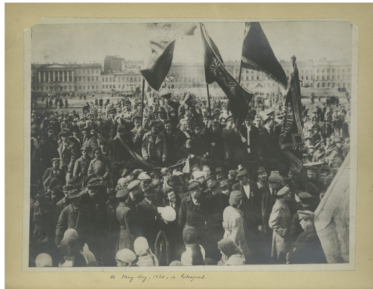
May Day, 1920, in Petrograd (formerly St. Petersburg)

During its "short space" life, the Soviet Union officially endorsed May Day. After the Bolshevik Revolution of 1917, the Soviets chose May Day as the day to honor the proletariat – industrial workers of the lower social and economic class, and the people for whom the revolution was ostensibly fought and won. The Russians also called May Day "The Day of the International Solidarity of Workers." Throughout the Communist world, May Day would be celebrated with large military parades and thousands of marchers showing their support for the government.