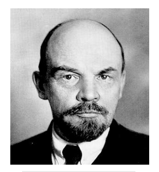
Lenin represented the 7<sup>th</sup> kingdom, the USSR

Petrograd) for the same purpose (to lead Russia after the Fall of the Romanovs).