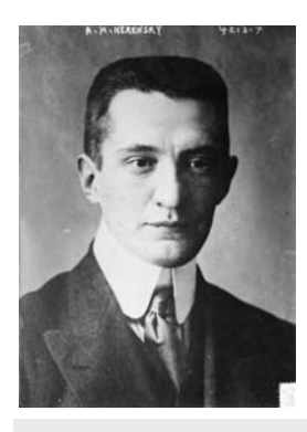
Kerensky represented the 8<sup>th</sup> kingdom, the U.S.