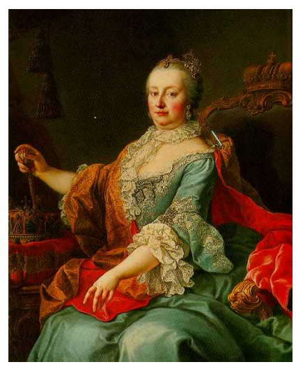
Maria Theresa of Austria

[Silesia was a region located mostly in what is today's southwestern Poland. Austria had taken over Silesia in 1526, but Prussia seized northern Silesia from Austria in 1742, shortly after Maria Theresa had taken the throne in 1740. She was the only female to rule during the 650-year-long Habsburg Dynasty.]