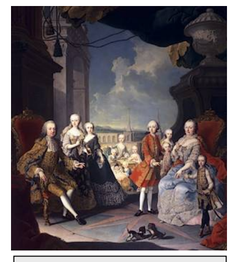
The painting The Royal Family on the Terrace of Schönbrunn Castle (Academy of Fine Arts, Vienna) shows Empress Maria Theresa, Archduchess of Austria, Queen of Bohemia and Hungary, in her family circle.

The war involved all major powers of Europe: (1) Prussia, (2) <u>Great Britain</u> (with British colonies in North America, the British East India Company, and