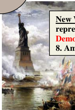
Liberty Enlightening the World

New World represented Democracy 8. America