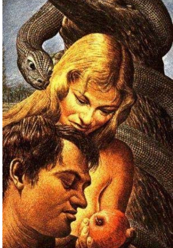
Genesis 3:5 (KJV) And when the woman saw that the tree was good for food, and that it was pleasant to the eyes, and a tree to be desired to make one wise, she took of the fruit thereof, and did eat, and gave also unto her husband with her; and he did eat.