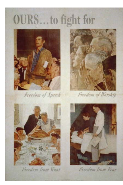
A poster ( left ) depicting the "Four Freedoms," one of which is "Freedom of Worship" ( right ), from President Roosevelt's famous speech of January 6, 1941

Key Understanding: The subtle deception of "religious freedom." One of the most subtle deceptions in the battle between the Cross of Jesus Christ and the Rights of Man is that of "religious freedom." The very words "religious freedom" should not be confused with the true spiritual freedom of the cross of Jesus Christ.