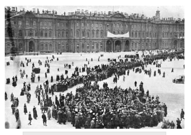
Protesters gather outside the tsar's palace in Petrograd (Saint Petersburg) in 1917

The city at the center of these changes was St. Petersburg, Russia. It was on March 8, 1917, that the storm of revolution broke out so strongly in St. Petersburg that the government of Tsar Nicholas II fell. The new democratic Provisional Government would, of course, be centered in St. Petersburg.