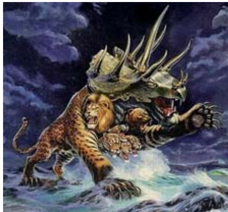
Image – an image is an exact likeness , a reproduction or imitation of a person or thing. One dictionary also says, to reflect, mirror .

Mirror – to mirror is to reflect , or form an image by reflection .