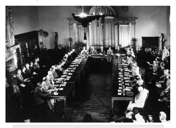
The Conference on Security for Peace in the Post-War World held at Dumbarton Oaks, Washington D.C., August 21, 1944

Step 7, Dumbarton Oaks Conference, August to October 1944.