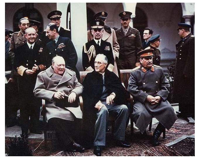
The "Big Three" at the Yalta Conference, Winston Churchill, Franklin D. Roosevelt, and Joseph Stalin

February 4-11, 1945. Roosevelt, Churchill, and Stalin met in Yalta in the Crimea. Much was decided at this wartime conference, including the unconditional surrender of Germany, and that Germany would be divided into four parts. As concerns the United Nations, once it was agreed upon that each of the five (5)permanent members of the Security Council would have veto power, Roosevelt obtained a commitment by Stalin to participate in the United Nations. They announced that a conference of the United Nations would open in San Francisco on April 25, 1945. The conference would use the plan worked out at the Dumbarton Oaks Conference to help prepare a charter for the United Nations.