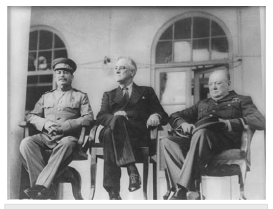
The Tehran Conference was the meeting of Joseph Stalin, Franklin D. Roosevelt, and Winston Churchill between November 28 and December 1, 1943, in Tehran, Iran.

Step 6, Tehran Conference, November 28 – December 1, 1943.