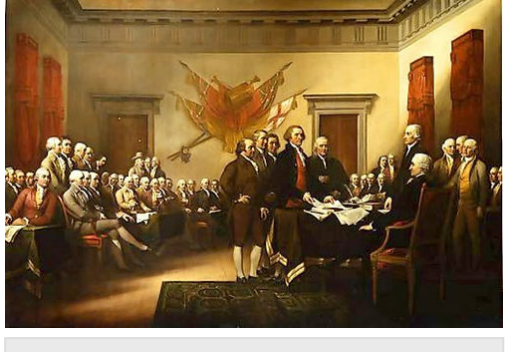
The signing of the Declaration of Independence

The United States Declaration of Independence reads in part: