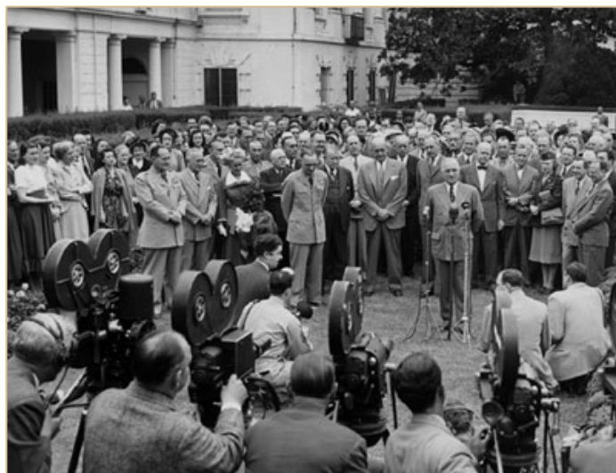
May 17, 1949. President Harry S. Truman speaking before the press in the Rose Garden of the White House on the occasion of a reception for General Lucius Clay upon his return from Germany.

Wir danken dem bewahrer unserer freiheit – We thank the defender of our freedom.