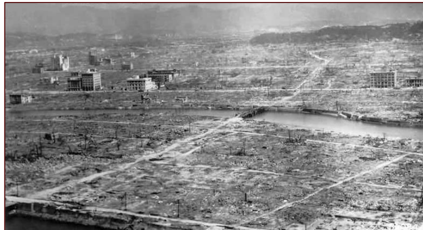
Hiroshima in the aftermath of the bombing

Key Understanding: Who can make war with the Beast? Not Japan. Clearly then, we see the August 6 U-238 Hiroshima and August 9 Pu-239 Nagasaki atomic bombs as a part of the Revelation 13:4 question, ‘Who is able to make war with the Beast?’ – a question crossing the minds of the peoples of the world after the display of the might of America’s atomic bombs.