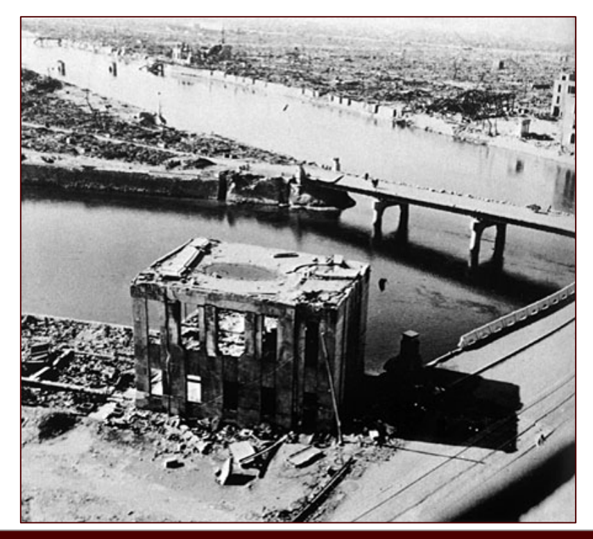
On August 6, 1945, the Red Cross building ( above ) in Hiroshima was close to the hypocenter and did not fare well. But the beast was healed ( below ).