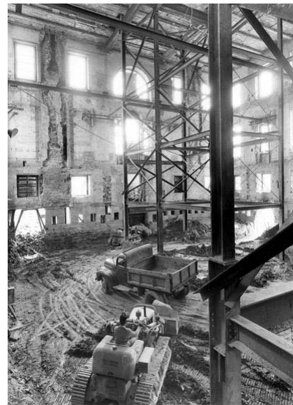
White House reconstruction, 1948-1952

Revelation 13:2 (KJV) And THE BEAST [out of the Sea] WHICH I SAW WAS LIKE UNTO A LEOPARD, and HIS FEET WERE AS THE FEET OF A BEAR, and HIS MOUTH AS THE MOUTH OF A LION: and THE [Great Red] DRAGON [Satan] GAVE HIM [the Beast out of the Sea] HIS POWER, AND HIS SEAT, AND GREAT AUTHORITY. [The Beast’s power, seat, and authority ultimately and symbolically reside at the 132-room White House, expanded to 132 rooms during the presidency of Harry Truman.]