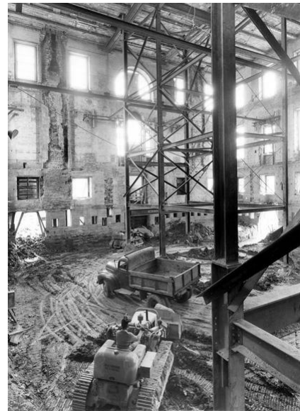
White House reconstruction, 1948-1952

Revelation 13:2 (KJV) And THE BEAST [out of the Sea] WHICH I SAW WAS LIKE UNTO A LEOPARD, and HIS FEET WERE AS THE FEET OF A BEAR, and HIS MOUTH AS THE MOUTH OF A LION: and THE [Great Red] DRAGON [Satan] GAVE HIM [the Beast out of the Sea] HIS POWER, AND HIS SEAT, AND GREAT AUTHORITY. [The Beast's power, seat, and authority ultimately and symbolically reside at the 132-room White House, expanded to 132 rooms during the presidency of Harry Truman.]