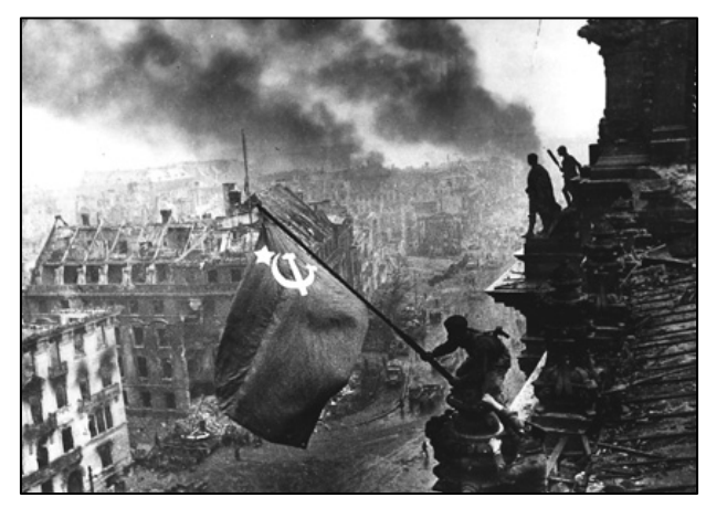
A Soviet soldier raises the USSR flag over Berlin