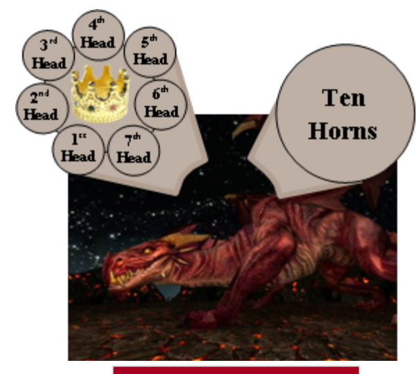
The Great Red Dragon

Let's start by reviewing the relationship between Revelation 12:3, where we see a Great Red Dragon with Seven Heads, and Revelation 17:3, where we see a Scarlet Beast (out of the Pit, Revelation 17:8) with Seven Heads.