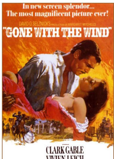
VIVIEN LEIGH LESLIE HOWARD OLIVIA de HAVILLAND

The 1939 movie Gone With The Wind was adapted from the novel. The movie won 10 Academy Awards and as of 2006 was the highest grossing film in box-office history,