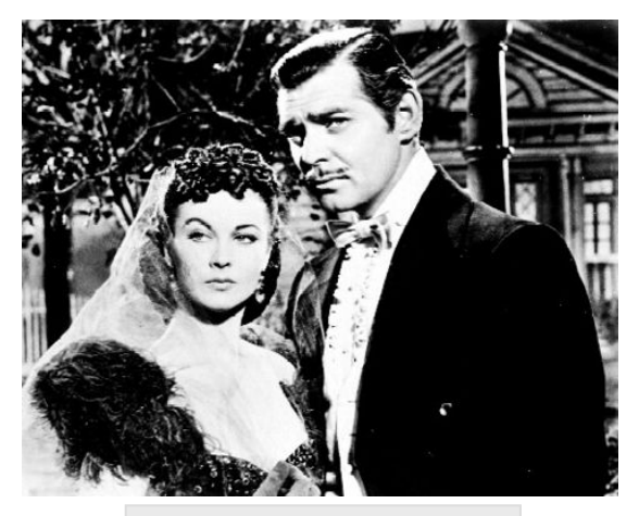
Vivien Leigh and Clark Gable

The Lord used Gone With The Wind to accurately characterize the South's Civil War rebellion against the North as a <u>Scarlet(t)</u> <u>Revolution</u>, but we also have now seen that the Revolutionary War birth of America was the birth of the 8<sup>th</sup> Head <u>Scarlet</u> Beast out of the Pit.