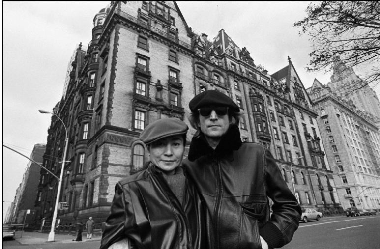
John Lennon and Yoko Ono outside the Dakota