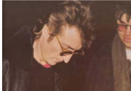
John Lennon autographing Double Fantasy for his killer, Mark David Chapman

9 And he said, Go thy way, Daniel: for the words are closed up and sealed till THE TIME OF THE END .