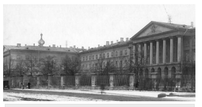
circa 1917: Smolny Institute, Petrograd (St Petersburg)

#423 Ending the USSR to Build the Second Babel – The Rise and the Removal of the Latter Day Genesis 11:6-7 Restrainer and Confounder, part 2, The November 6-7 Birth of the USSR