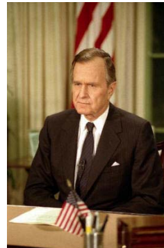
George H. W. Bush – Cold War Defeated the 7 th Head Soviet Union