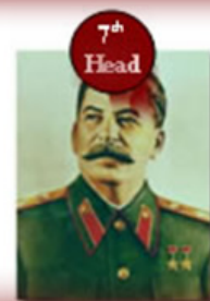
Cold War The Soviet Union death of Soviet Communism

[The wounding of triple 7 th Heads appeared on Unsealing #400 .]