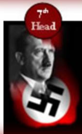
World War II Germany death of Fascism