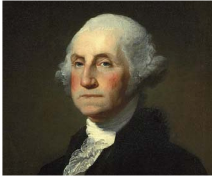
George Washington – Revolutionary War Defeated the “forerunner” 7 th Head Great Britain