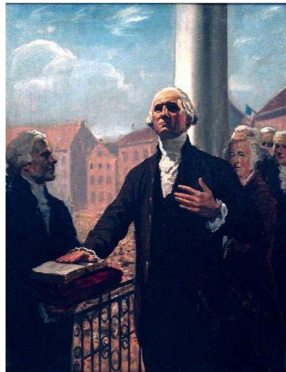
Robert R. Livingston administered the oath of office to George Washington on April 30, 1789

Key Understanding: The counterfeit living stone. Similarly, just as Jesus Christ (the head of the body of Christ) is the Living Stone/Chief Cornerstone (1 Peter 2:4, 6) of the spiritual house of God, of which believers are also " living stones " (1 Peter 2:5), George Washington (the head of the body of Americans) was also the counterfeit Living Stone/Chief Cornerstone of the counterfeit spiritual house of God, the body of Americans. This is why Robert R. Livingston, whose name points to living stone , was the man who administered the oath of office at Washington's inauguration on April 30, 1789. George Washington became the Living Stone President.