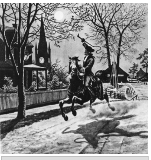
Paul Revere's ride

Key Understanding: The April 15 order . The orders for British General Thomas Gage to march to Concord, Massachusetts, which would spark the Revolutionary War, were given on April 15, 1775, in fulfillment of the words of 2 Corinthians 6:15. [Again, the Lord used a 2-month date change in the fulfillment of prophecy. April 15 + 2 months = 6:15.]