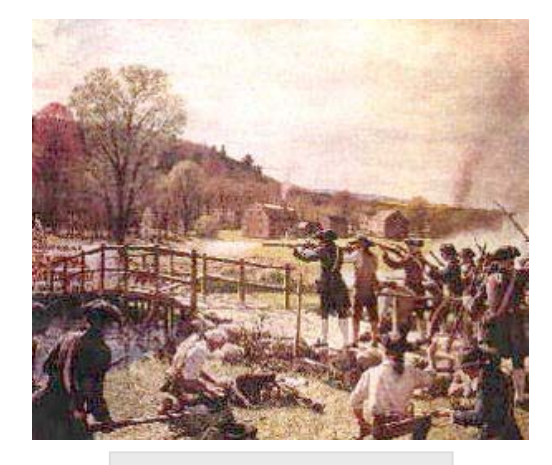
The fight at Concord Bridge

15 AND WHAT CONCORD HATH CHRIST WITH BELIAL? or what part hath he that believeth with an infidel?