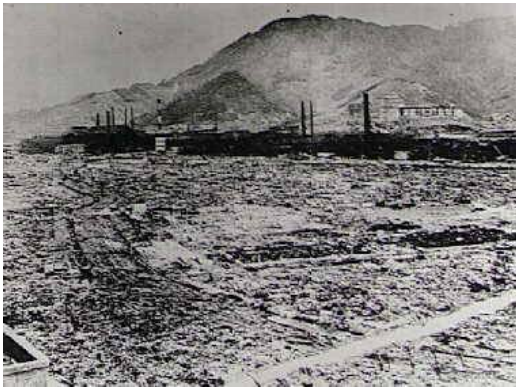
The aftermath of Hiroshima

As concerns the salient point of this Unsealing, Sodom was the recipient of a literal “rain of fire and brimstone out of heaven,” while Japan was the recipient of a literal “rain of ruin from the air.”