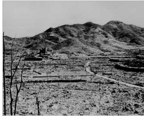
The aftermath of Nagasaki

Here is #488–Doc 1, about a book titled Rain of Ruin: A Photographic History of Hiroshima and Nagasaki .