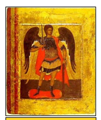
Russian icon, Michael the Archangel

In Unsealings #498_#499 was discussed Michael the Archangel and War; in this Unsealing #500 is discussed Michael the Archangel and Russia. Michael the Archangel is significantly attached to both war and Russia, and all are a part of Daniel 12.