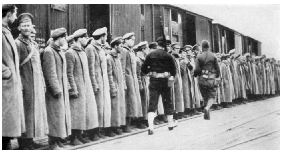
Bolshevik prisoners under the custody of U.S. troops in Archangel

[Sources for the above paragraphs, (1) Trotsky: A Photographic Biography , by David King, p. 82, © 1986; (2) A History of the Modern World , by R.R. Palmer, Joel Colton, p. 710, © 1978; (3) A Concise History of World War I , prepared for The Encyclopedia Americana, p. 305-306, © 1964. The above is consolidated from chart 1879, tape #25, titled Archangel , of the John Calvin Series .]