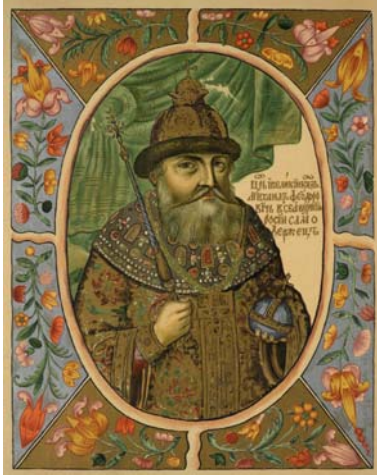
Tsar Michael Romanov

Daniel 12:1 (KJV) And at that time SHALL MICHAEL [the Archangel] STAND UP , the great prince which standeth for the children of thy people: and there shall be A TIME OF TROUBLE , such as never was since there was a nation even to that same time: and at that time thy people shall be delivered, every one that shall be found written in the book.