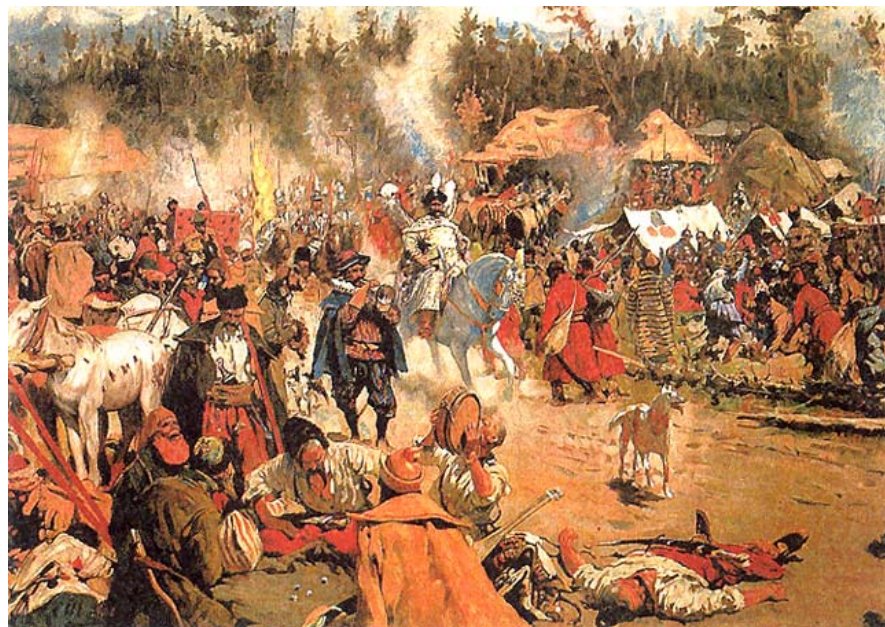
Scene from the Time of Troubles in Russia, by Russian painter Sergey Vasilyevich Ivanov (1864-1910)

Key Understanding: The Time of Troubles in Russia in the early 1600’s was a part of the fulfillment of Daniel 12:1. The Time of Troubles ended in 1613 with the advent of Mikhail Romanov to the throne of Russia, which birthed the Romanov Dynasty that ended in 1917.