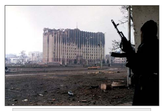
A Chechen fighter near the Presidential Palace in Grozny, January 1995

The Soviet Union , which existed from 1922-1991, was composed of 15 different Soviet states (or union republics , and thus the Union of Soviet Socialist Republics ), of which Russia was only one, but by far the most significant. Others of large significance were the Ukraine and Belarus.