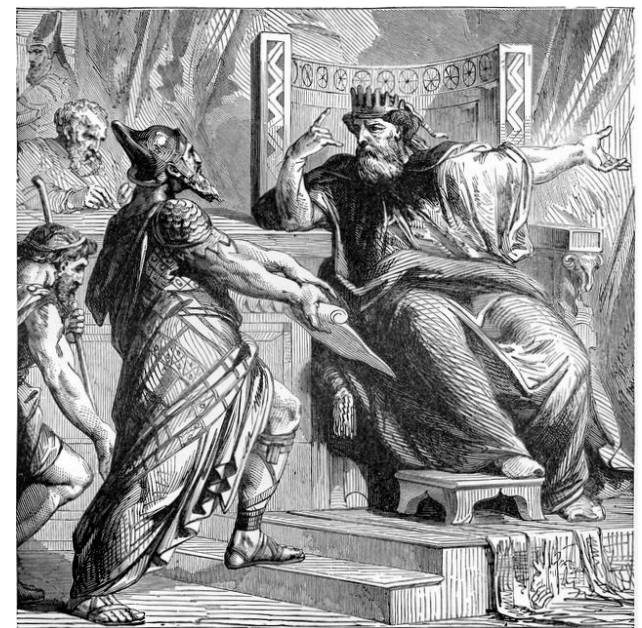
David orders Israel numbered

thousand <u>MEN THAT DREW SWORD</u>: and Judah was four hundred threescore and ten thousand