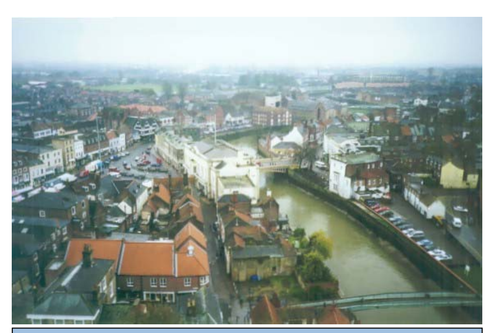
Overhead view of Boston, Lincolnshire, central England, which had its start as a "habitation of demons"

Revelation 18:2 (KJV) And he cried mightily with a strong voice, saying, BABYLON THE GREAT IS FALLEN, IS FALLEN, AND IS BECOME THE HABITATION OF DEVILS, and the hold of every foul spirit, and a cage of every unclean and hateful bird.