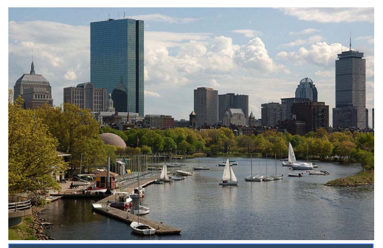
Boston, Massachusetts (above) had its beginnings as a city upon a hill

City on a Hill. When Ronald Reagan referred to America as a City on a Hill, he was referencing John Winthrop's famous 'City Upon a Hill' speech reputedly given aboard the flagship Arbella of the Winthrop fleet of eleven ships and 700 people during the great Puritan migration from April through the early summer of 1630. [Research indicates the speech may have actually been delivered in England prior to their departure.] Winthrop surmised that the Massachusetts Bay Colony that they were founding would become a "city upon a hill," watched by the world.