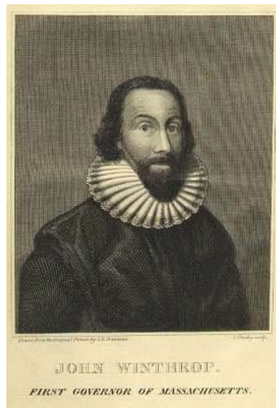
JOHN WINTHROP. FIRST GOVERNOR OF MASSACHUSETTS.

The Lord ordained that through the person of Ronald Reagan there exists the contrast of America as a Matthew 5:14 City on a Hill (which was Reagan’s viewpoint, and false) vs. America as a Revelation 18:2 ‘Regan’ “ habitation of devils ” (which is the Lord’s viewpoint, and true), though it is playing the role of The Exorcist of evil.