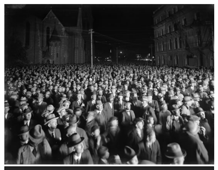
Election-night crowd in Christchurch, New Zealand, 1930's

25 Now therefore, I pray thee, pardon my sin, and turn again with me, that I may worship the LORD. 26 And Samuel said unto Saul, I will not return with thee: for <u>THOU</u> <u>HAST REJECTED THE WORD</u> <u>OF THE LORD, AND THE LORD</u> <u>HATH REJECTED THEE FROM</u> <u>BEING KING OVER ISRAEL</u>.