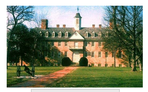
College of William and Mary

Key Understanding: Blairs and the Bill of Rights . The Lord ordained that <u>Blairs</u> in America would be connected to the theme of <u>Bills of Rights</u>, so as to confirm the entire theme of the Crown Shift, with America's 'Ten Horns' Bill of Rights serving as The Exorcist of political evil in the world.