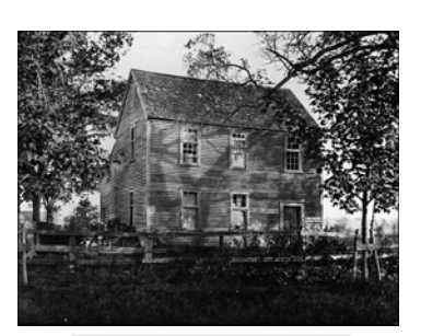
The Parris home

The name Parris would most often be associated with the <u>city</u> of Paris, France. Because of that, the fact that the alleged demon-possessions of 1692