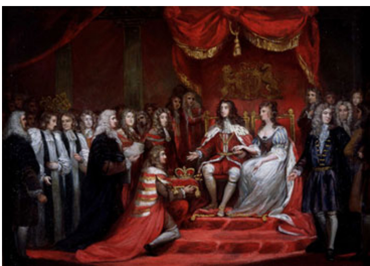
The 1688 invitation from a Puritan-oriented Parliament to William III, Prince of Orange, to become King of England, but under the condition of agreeing to what became known as the English Bill of Rights. This was a picture of the Woman reigning over a King.

America. The Mather rebellion of 1688-1689 against King James II, and then the Revolutionary War of 1775-1776 against King George III, were also pictures of the Woman reigning over a King, with the end result being the birth of the Beast, or Babylon the Great, by the Woman.