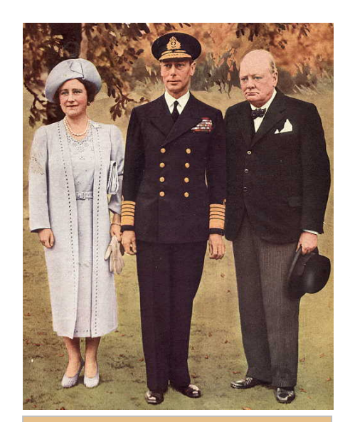
King George VI called for a National Day of Prayer

The May 26<sup>th</sup> National Day of Prayer. On May 26, 1940, day one of Operation Dynamo, a National Day of Prayer was declared in Britain. The BBC broadcast a morning service from Westminster Abbey during which the Archbishop of Canterbury, senior primate of the Anglican Church (Church of England), led prayers "for our soldiers in dire peril in France."