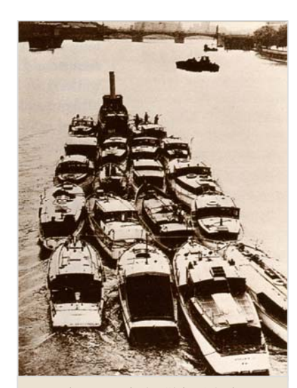
(above) 'Little Ships' being towed down the Thames at the start of 'Operation Dynamo', the rescue of British soldiers off the beaches of Dunkirk

Revelation 13:2 (KJV) And THE <u>BEAST</u> [out of the Sea] WHICH I SAW WAS LIKE UNTO A <u>LEOPARD</u>, and HIS FEET WERE AS THE FEET OF A <u>BEAR</u>, and HIS MOUTH AS THE MOUTH OF A <u>LION</u>: and <u>THE</u> [Great Red] <u>DRAGON</u> [Satan] <u>GAVE HIM</u> [the Beast out of the Sea] <u>HIS POWER</u>, AND HIS SEAT, AND GREAT AUTHORITY.