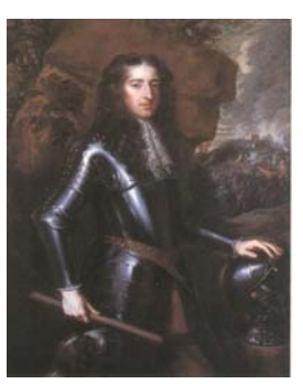
Tides of change: William III of Orange (above) launched a colossal armada (right) to seize the throne from Catholic King James II

Key Understanding: The invasion of England by William III of Orange and Revelation 13:1. It is time to insert William of Orange's invasion of England to be yet another part of the literal layered fulfillment of Revelation 13:1 and the Beast rising out of the sea. The ultimate Beast, of course, is America, not England, but (i) William of Orange's invasion to firmly establish England as a Protestant nation and (ii) the adoption of the English Bill of Rights were a part of the process leading to America rising as the Revelation 13:1 Beast out of the sea and the subsequent establishment of the U.S. Bill of Rights, which are the crowned Ten Horns of Revelation 13:1.