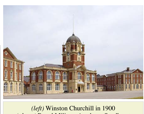
(above) Royal Military Academy Sandhurst