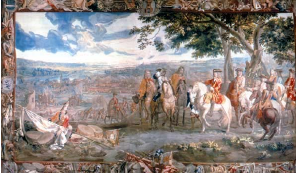
The Battle of Blenheim (scene from the Tapestry at Blenheim Palace)

Click here for the Original Source of #690–Doc 1