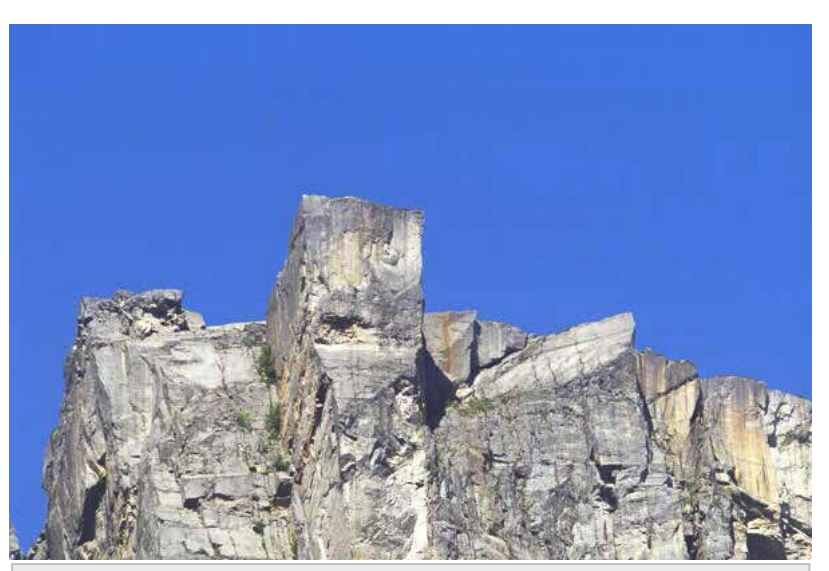
This is Pulpit Rock in Norway, as viewed from below

25 And the rain descended, and the floods came, and the winds blew, and beat upon that house; and it fell not: for it was founded upon a rock.