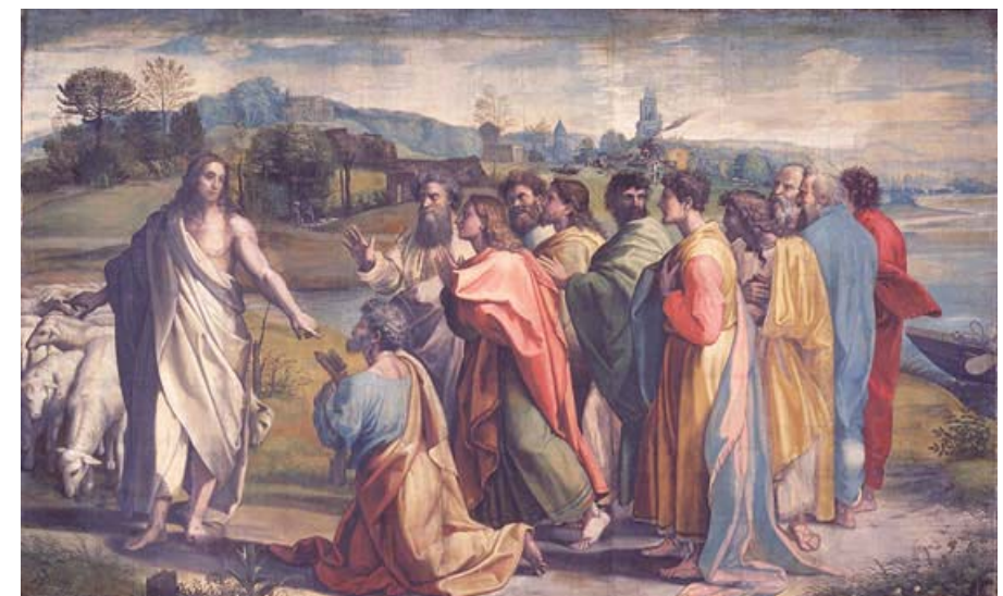
Christ's Charge to Peter, Matthew 16:18-19 by Raphael

17 And Jesus answered and said unto him, Blessed art thou. Simon Barjona: for flesh and blood hath not revealed it unto thee, but my Father which is in heaven. 18 And I say also unto thee, THAT THOU ART PETER, AND <u>UPON THIS ROCK I</u> WILL BUILD MY CHURCH; and the gates of hell shall not prevail against it.